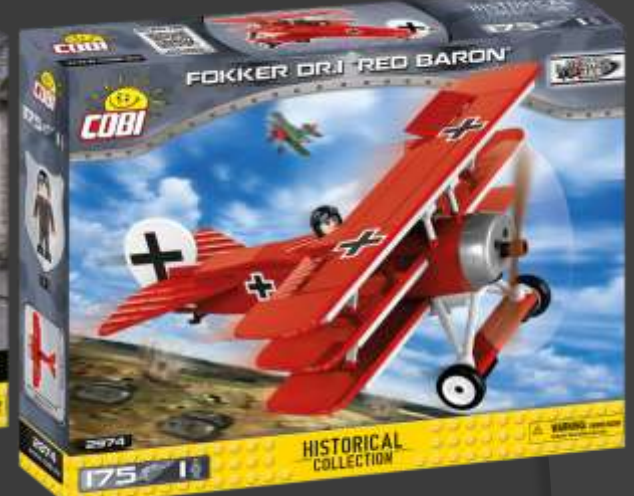
Fokker Dr.1 Red Baron