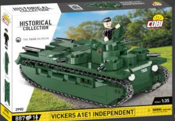
Vickers A1E1 Independent