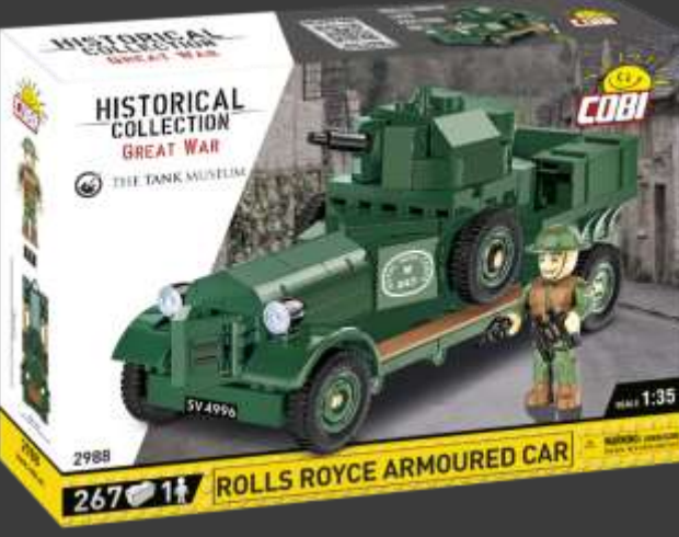
Rolls-Royce Armoured Car Mk I