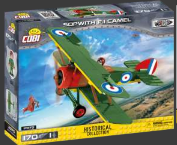
Sopwith Camel F.1