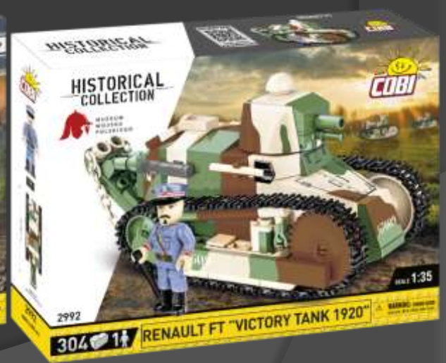
Renault FT "Victory Tank 1920"